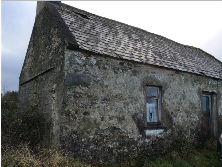
Plate 15: CH6 adjacent to proposed OGC route at Durha Td.