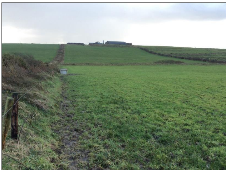
Plate 6: Proposed OGC route in pasture further to SE, looking SE.