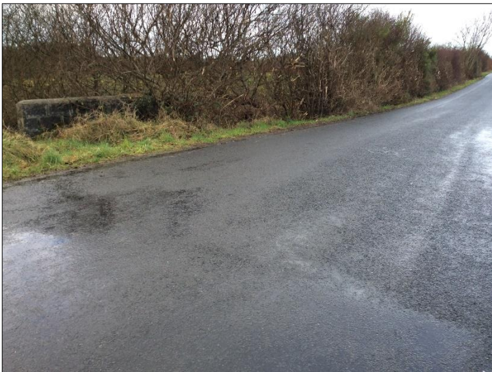
Plate 12: CH2 on proposed OGC at Moanmore Upper/Moanmore North Tds.