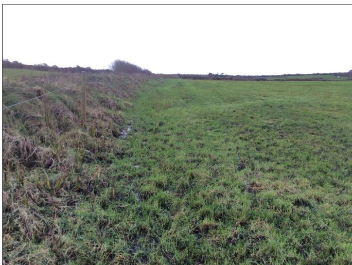
Plate 7: Proposed OGC in pasture looking SW.