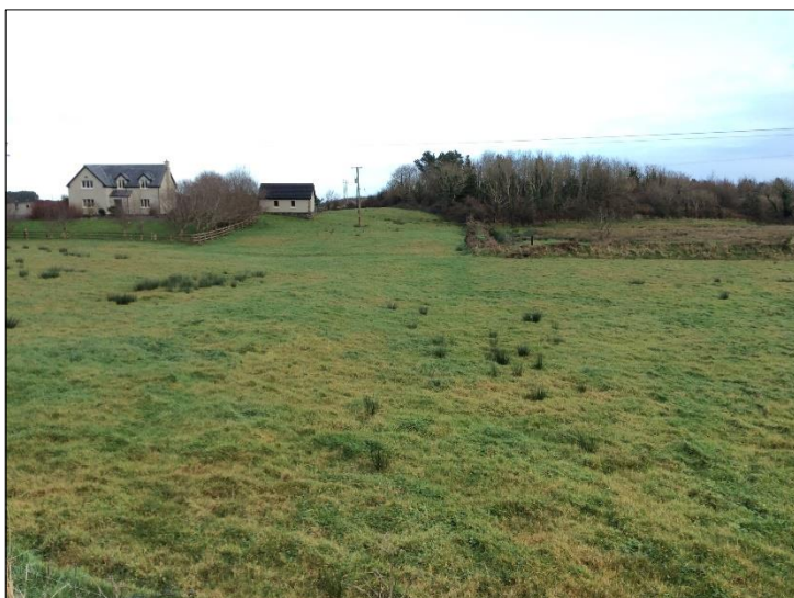
Plate 19: Proposed OGC route through pasture at Durha and Ballykett Tds., looking E.