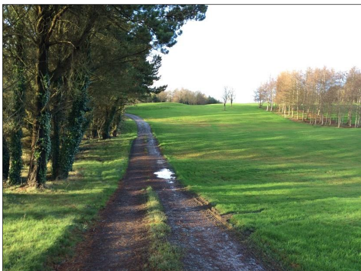
Plate 22: Proposed OGC route further to SE in Kilrush Golf Course, looking NW.