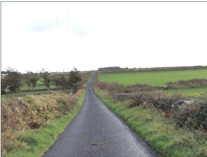
Plate 9: Proposed OGC route on public road Doonmore Td., looking SE.