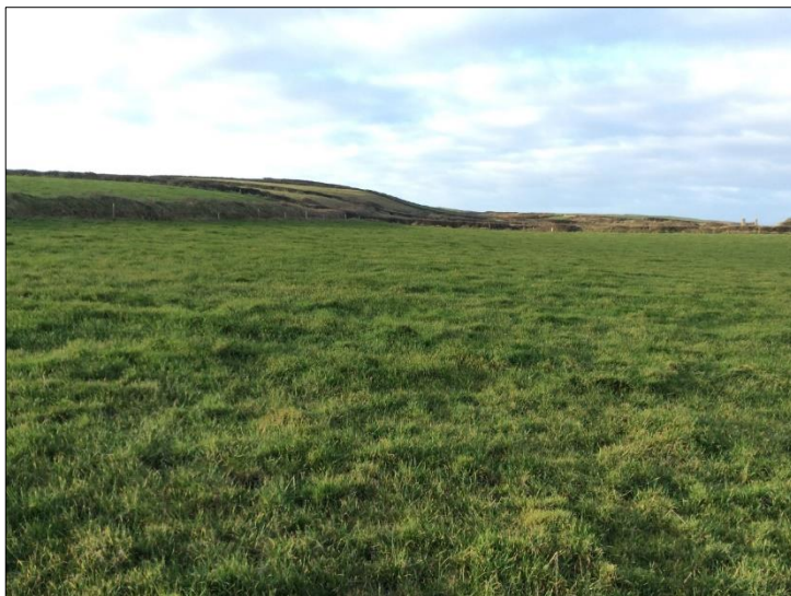
Plate 2: Proposed Temporary Construction compound, looking SW.