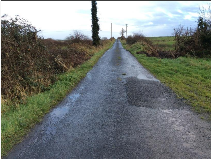
Plate 14: Proposed OGC route at Carnaun/Durha Tds. And vicinity of CH5, looking NE.