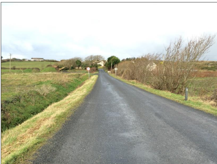
Plate 10: Proposed OGC route further to SE in Doonmore Td., looking NW.