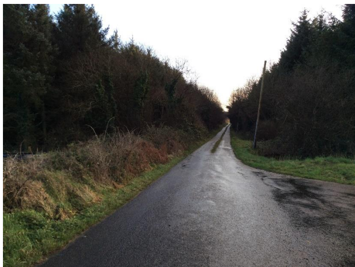
Plate 27: Proposed OGC route, Dysert Td., looking S.