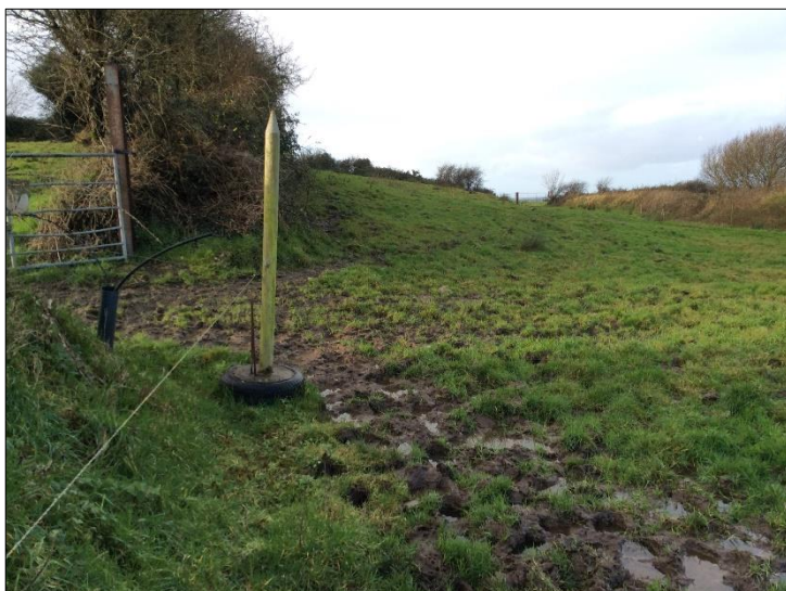
Plate 18: Proposed OGC route to east of Ringfort CL057-040—, looking NW.