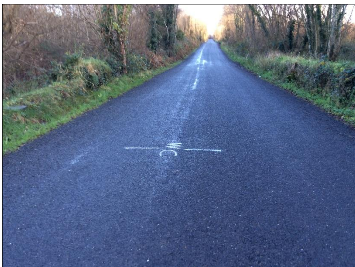
Plate 25: CH2 on proposed OGC route (Parknamoney/Kilcarroll Tds.), looking SE.