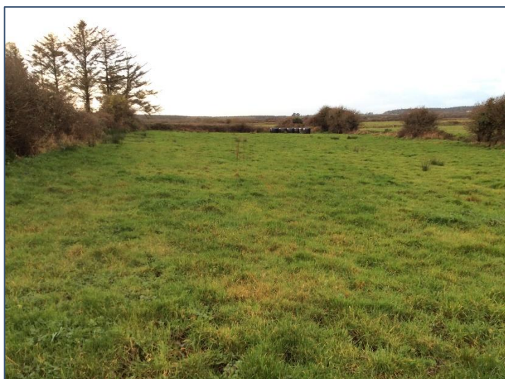
Plate 29: North-west side of proposed OCC, looking W.