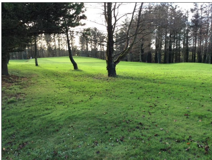
Plate 24: Location of CL057-062—Redundant record to W of proposed OGC route, looking WSW.