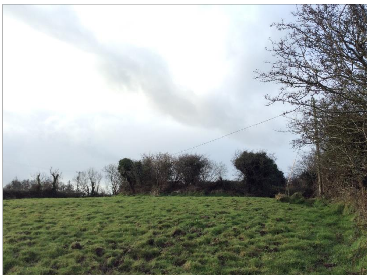
Plate 17: Ringfort CL057-040— to west of proposed OGC, looking NW.