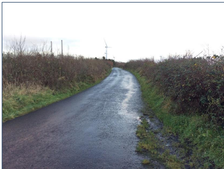
Plate 32: Proposed OGC route to south of proposed OCC, looking SE.