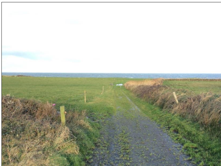
Plate 1: Approach to proposed Onshore Landfall Location from south, looking NW.