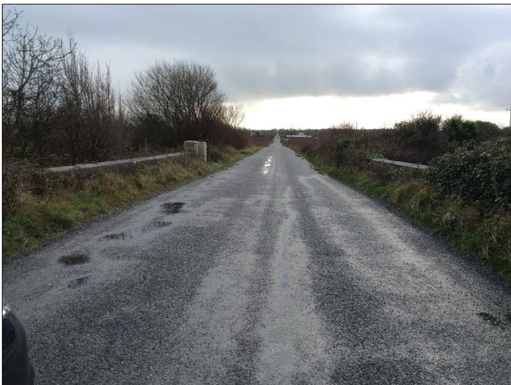
Plate 13: CH4 on proposed OGC route at Moanmore Lower/Moanmore South Tds.