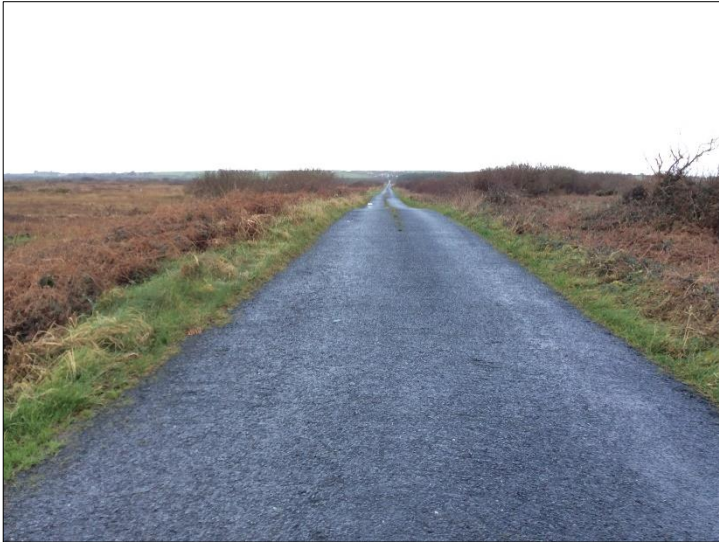
Plate 11: Proposed OGC route further to SE in Carrowmore South Td., looking NW.