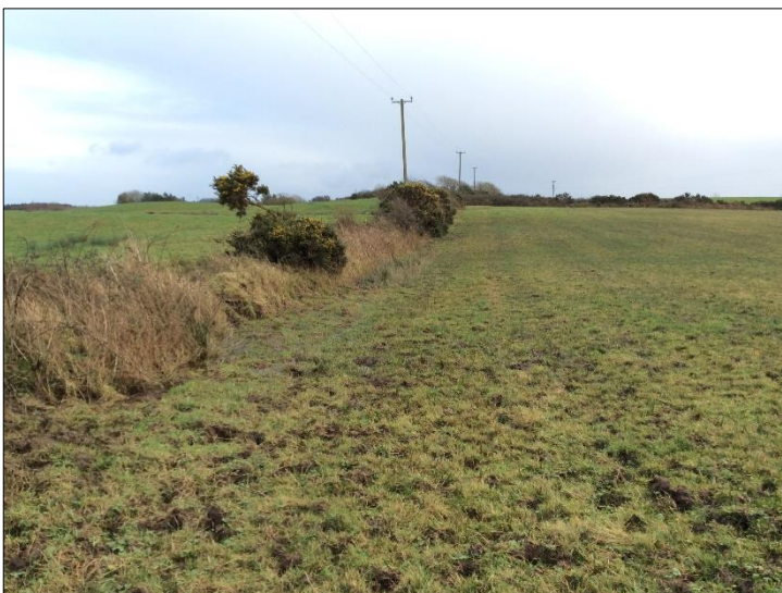
Plate 16: Proposed OGC route in pasture at Durha Td., looking SE.