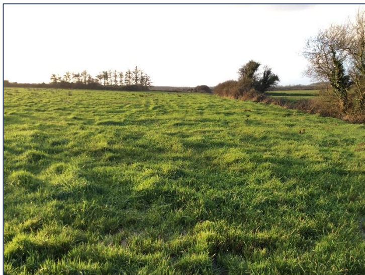
Plate 28: North side of proposed OCC, looking W.