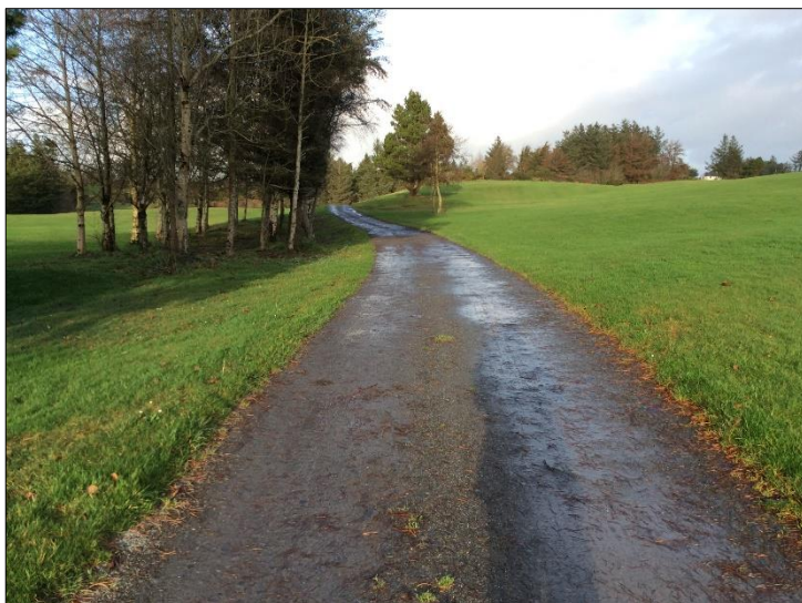
Plate 23: Proposed OGC route further to south in Kilrush Golf Course, looking NE.