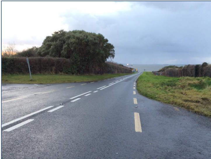
Plate 34: Proposed OGC route at Carrowdulia North Td., looking SW.