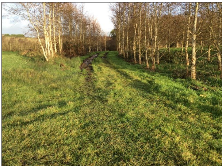
Plate 20: Proposed OGC route in Kilrush Golf Course, looking NE.