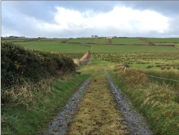
Plate 8: Proposed OGC route along existing track and in pasture (Doonmore Td.), looking NW.