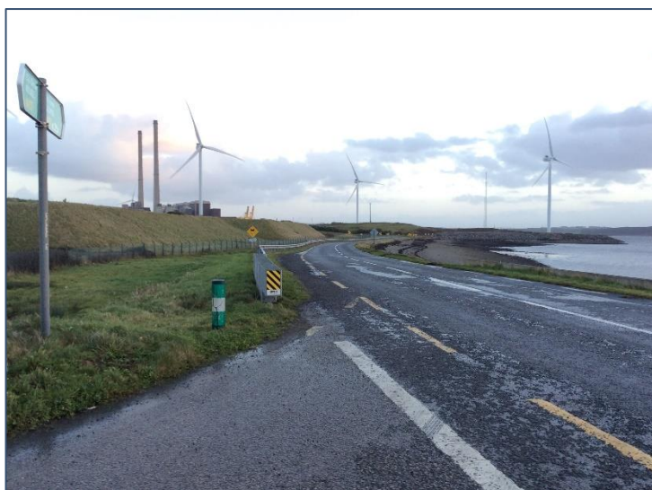
Plate 33: Proposed OGC route at Ballymacrinan and Carrowdotia North Tds., looking SE.