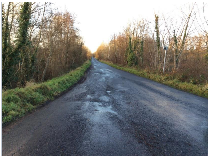
Plate 26: Proposed OGC route at Feagarroge/Kilcarroll/Dysert Tds., looking NW.