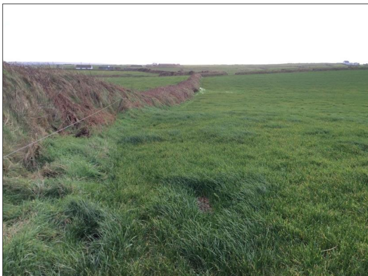
Plate 5: Proposed OGC route through pasture (Killard Td.), looking SE.