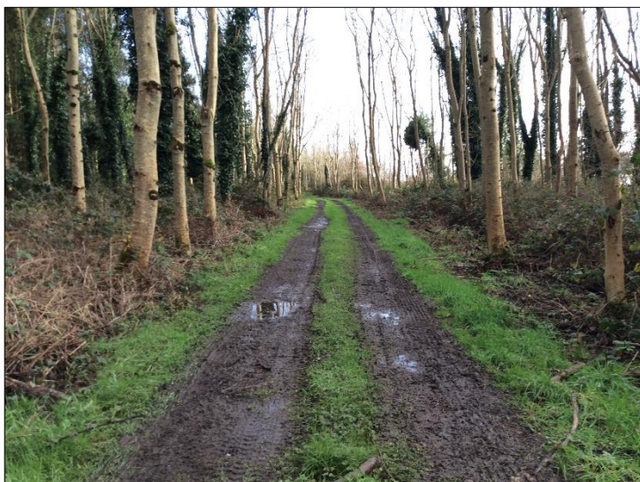
Plate 21: Proposed OGC route in Kilrush Golf Course, looking SE.