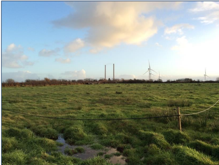
Plate 30: Proposed OCC, looking SE.