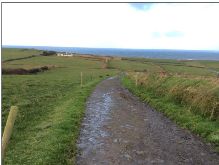
Plate 4: Proposed OGC route further to south (Killard Td.), looking NW.