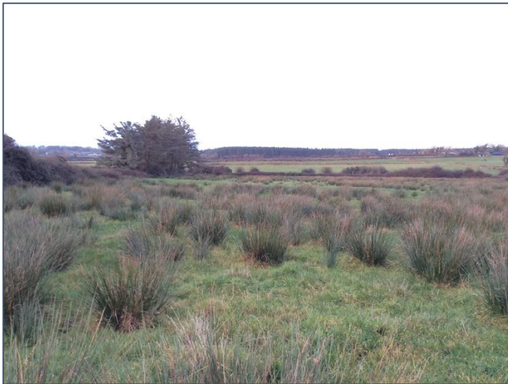
Plate 31: West side of proposed OCC, looking N.